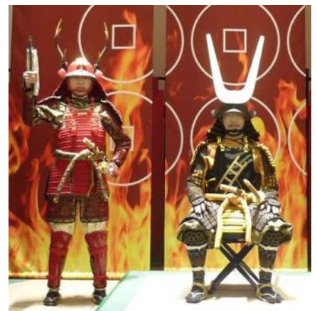
Armour of Sanada Yukimura and Sanada Masayuki

Furthermore, Sanada Yukimura and Sanada Masayuki's photo section, those from 'Kishu Mt.Kudo Sanada armour troop' will be set up at the Namba Station.