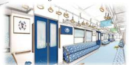
Image of the inside